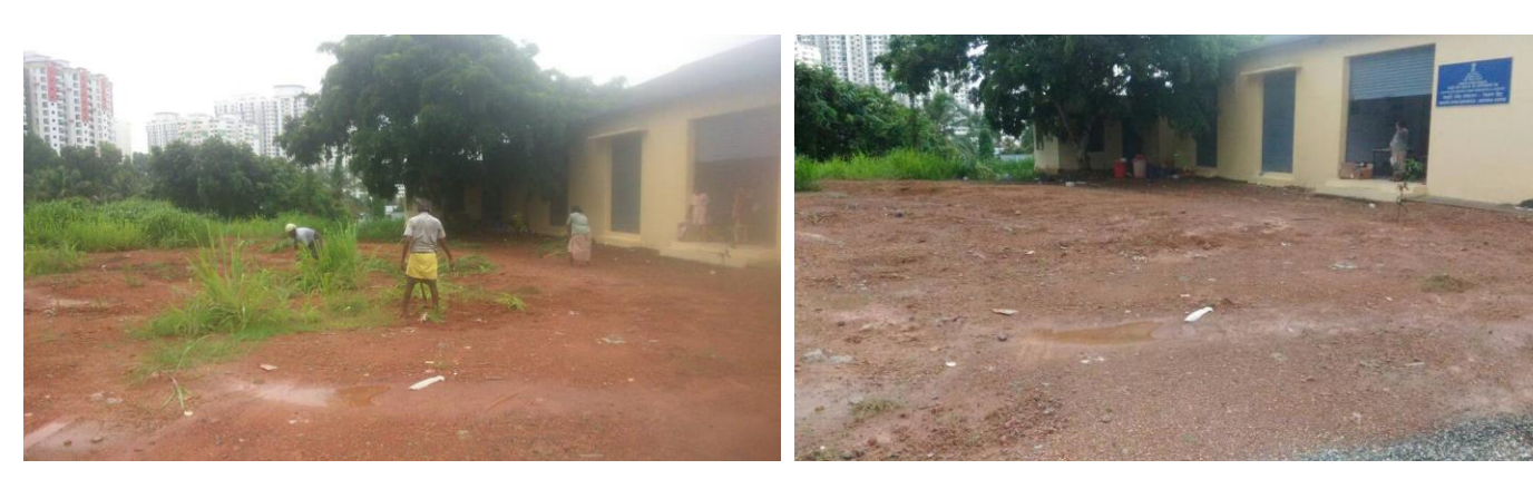
27<sup>th</sup> June 2017: Cleaning of MLR lab